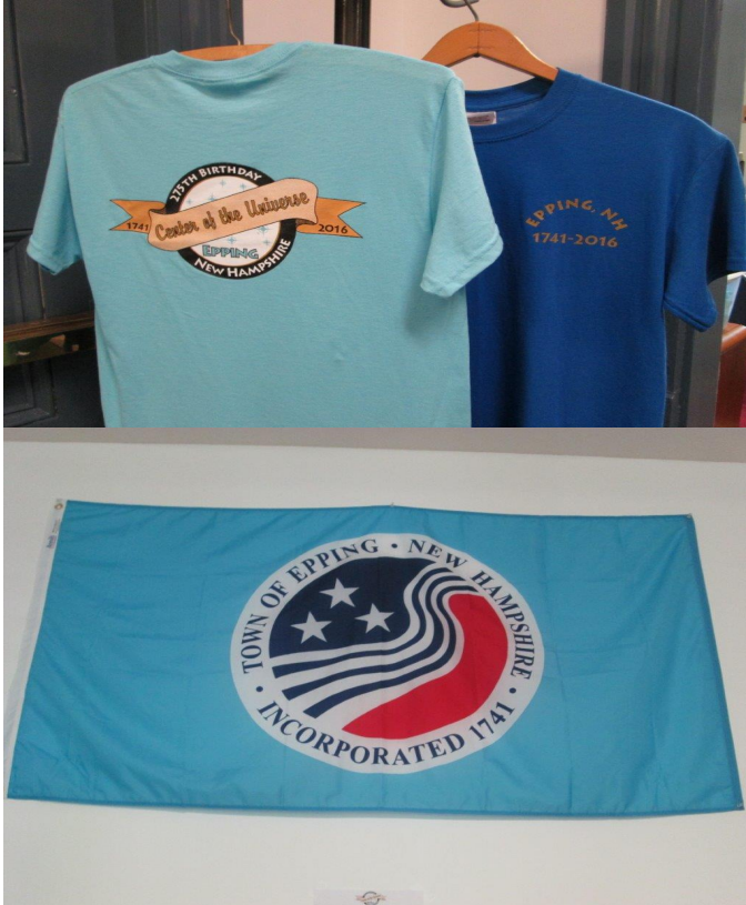
T-shirts and Flag