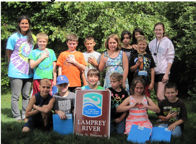
August 15: Some of the participants in the pilot Junior Rangers program

This summer, a group of dedicated participants in the Epping Summer Recreation program learned a lot about the Lamprey River. They covered such topics as watershed geography, history, recreational safety, wildlife, floodplains and pollution. They learned through maps, videos, animal sampling, plant and animal identification, a field trip to Mary Blair Park, a storm water tour of the school grounds, tying knots, quiz games and races, and their own artwork. Each Junior Ranger received a patch, personalized certificate, and a folder with key facts, pictures, and maps. Congratulations to all for a job well done!