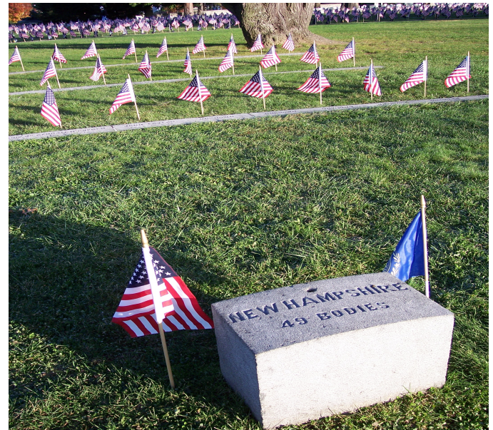
NH graves at Soldiers' Cemetery in Gettysburg